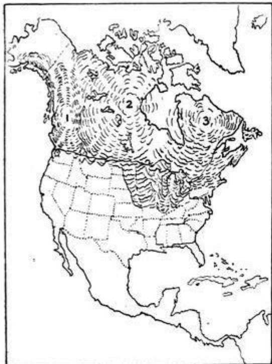
Outline map of North America at the time of most extensive ice cap. The glaciers radiated from three points, covered 4,000,000 square miles, and were probably two or three miles deep in some places. They disappeared probably 50,000 years ago. There have been several glacial epochs and there may be others in the future.

The atmosphere contains altogether 1,500,000,000,000 tons of carbon dioxide. Consequently the combustion of coal at the present rate will double it in about 200 years, unless it is removed by some means in enormous quantities. Carbon dioxide is removed from the atmosphere by growing plants, and in fact the carbon in the coal came from the air through the vegetable matter from which it has